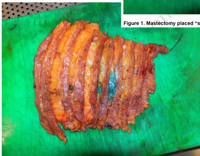
Figure 2. Mastectomy sliced sagittally from the posterior aspect