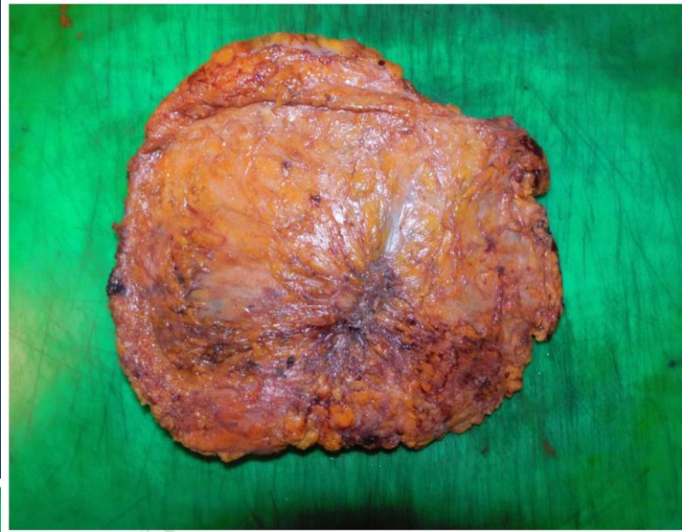
Figure 1. Mastectomy placed "skin side down"

1. Place the mastectomy "skin side down" (see Figure 1).