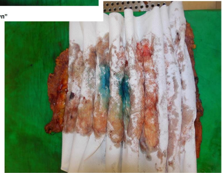
Figure 3. Blue roll placed between sagittal mastectomy slices.